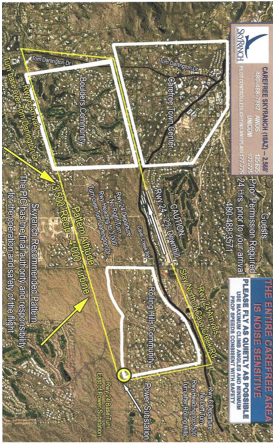
Exhibit 1: Airport Traffic Pattern